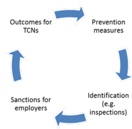
Figure 2: Illegal employment policy cycle

Figure 1 below depicts the different steps of illegal employment policy as a cycle. Firstly, the prevention measures and incentives for both employers and employees are depicted as a first step in the policy cycle. This is followed by identification of illegal employment through inspections and other measures which in turn leads to sanctions for employers and different outcomes for migrants (such as return to the country of origin or regularisation of stay and employment). It is recognised that the various steps do not necessarily follow chronologically from each other; however, the notion of a cycle is used in the Study for organisational purposes, as it helps to highlight the different aspects which the analysis will focus on.