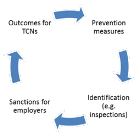
Figure 1: Illegal employment policy cycle