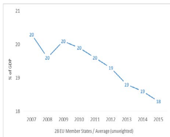
Figure 3: Average share of the informal economy in EU Member States' GDP

Levels lower than the average were estimated in the Netherlands , for example, where it amounted to 9% of the national GDP in 2015. Similar low levels can be attributed to the economies of Luxembourg (8.3%), Austria (8.2%) and United Kingdom (9.4%), as shown in Figure 3. 24 In Greece , on the other hand, available statistics show that the percentage of fully undeclared work increased from 29.7% of 2009 to 40.5% of 2013. However, since the Greek government increased fines for unregistered workers (up to 10,550 euros), the share fell to 25% in 2014 and kept declining steadily.