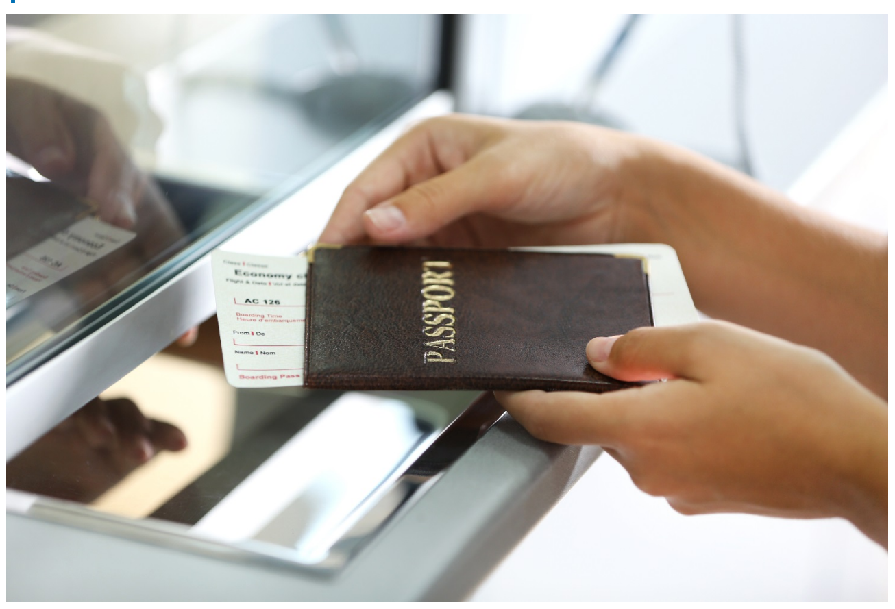
December 2017 - Final Version

Challenges and practices for establishing the identity of third-country nationals in migration procedures